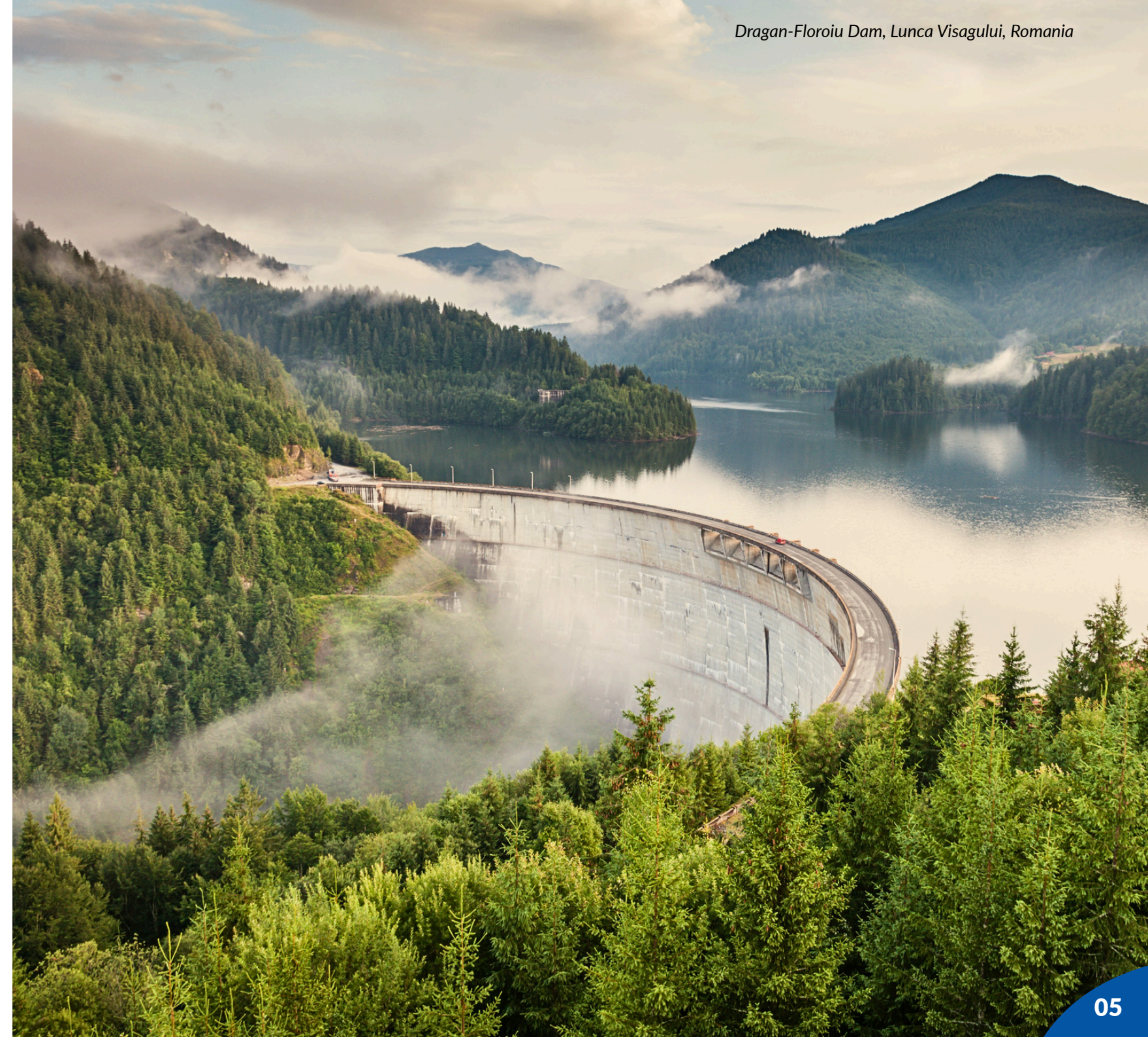
Dragan-Floroiu Dam, Lunca Visagului, Romania

In recent years, Romania has experienced a remarkable surge in popularity as a destination, not solely as a traveling option, as many are finding it to be an ideal place to not only visit but also to live and enjoy a fulfilling life .