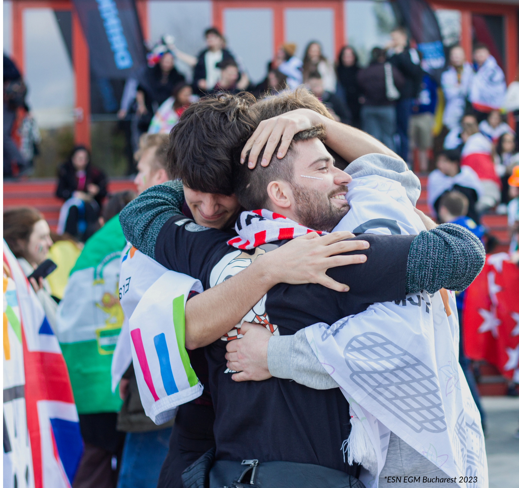
*ESN EGM Bucharest 2023

The center is located on Splaiul Independentei, no. 313, Library Building, Block A, 3rd Floor, Room 3.30 . The opening hours are from Monday to Friday, 09:00 - 17:00 . For further information, the following email address is available: centru.consiliere@upb.ro