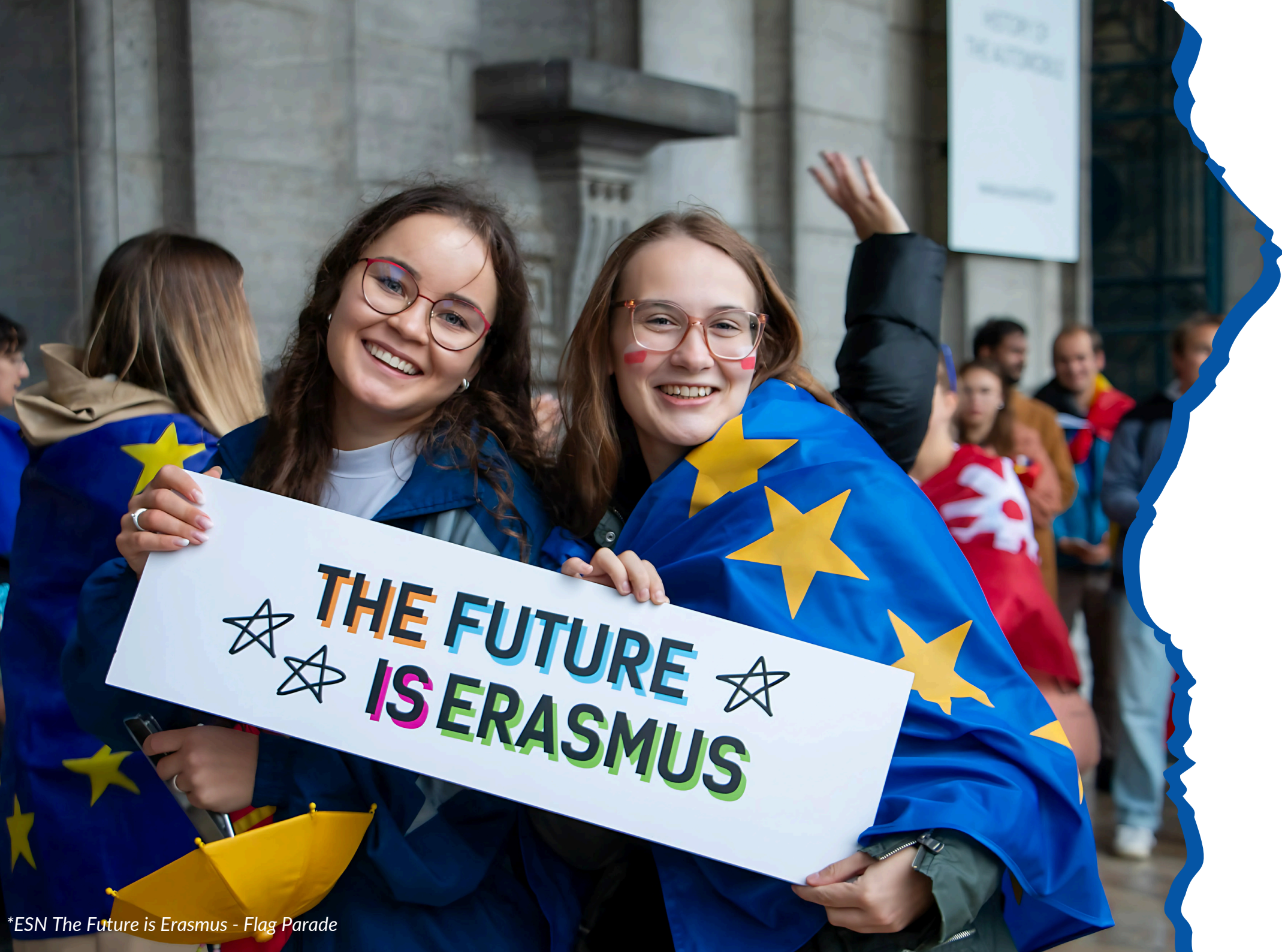
*ESN The Future is Erasmus - Flag Parade