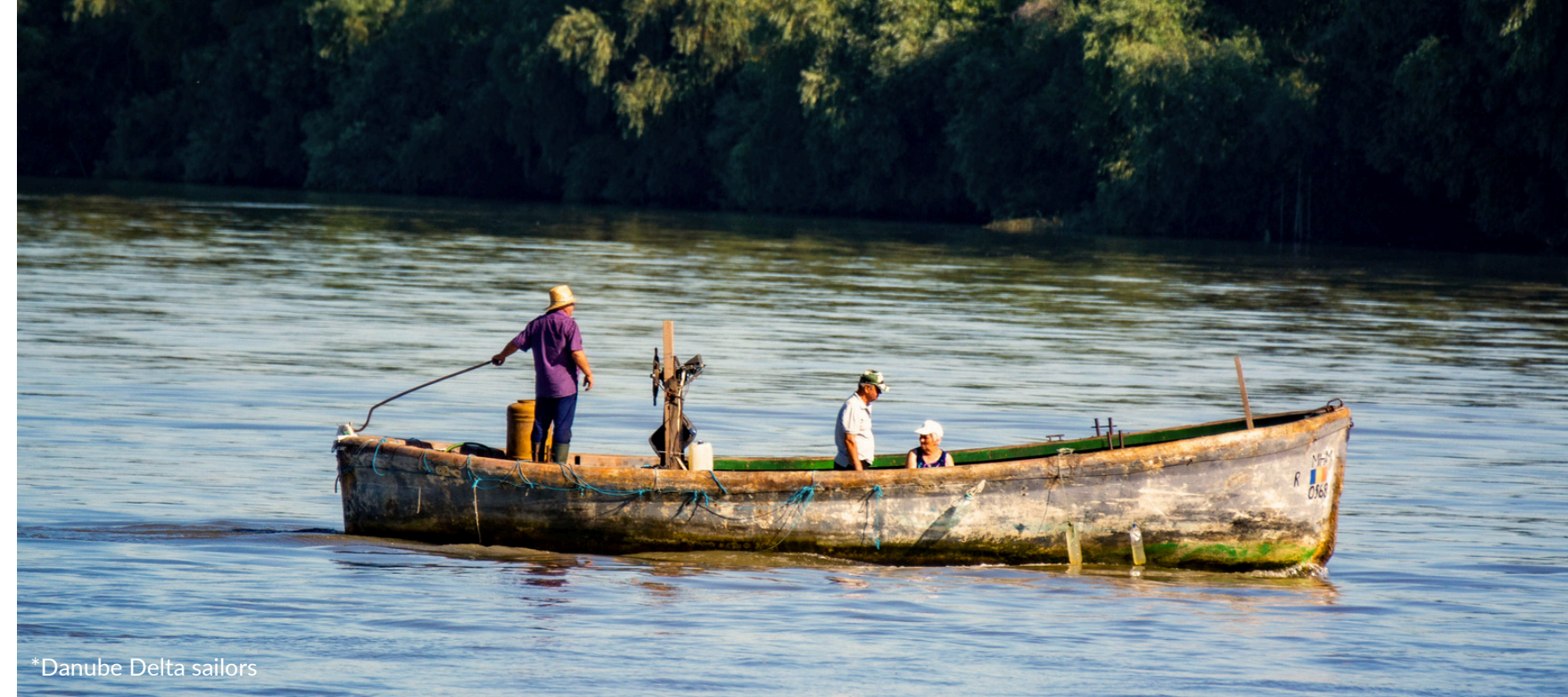
*Danube Delta sailors

In the village of Sapanta, Maramures, lies the Merry Cemetery, a truly unique graveyard where each wooden cross is painted in vivid colors and features a poetic, sometimes humorous epitaph. Created by local artist Stan Ioan Patras in the 1930s, the cemetery reflects a philosophy that embraces death with honesty, irony, and even a smile.