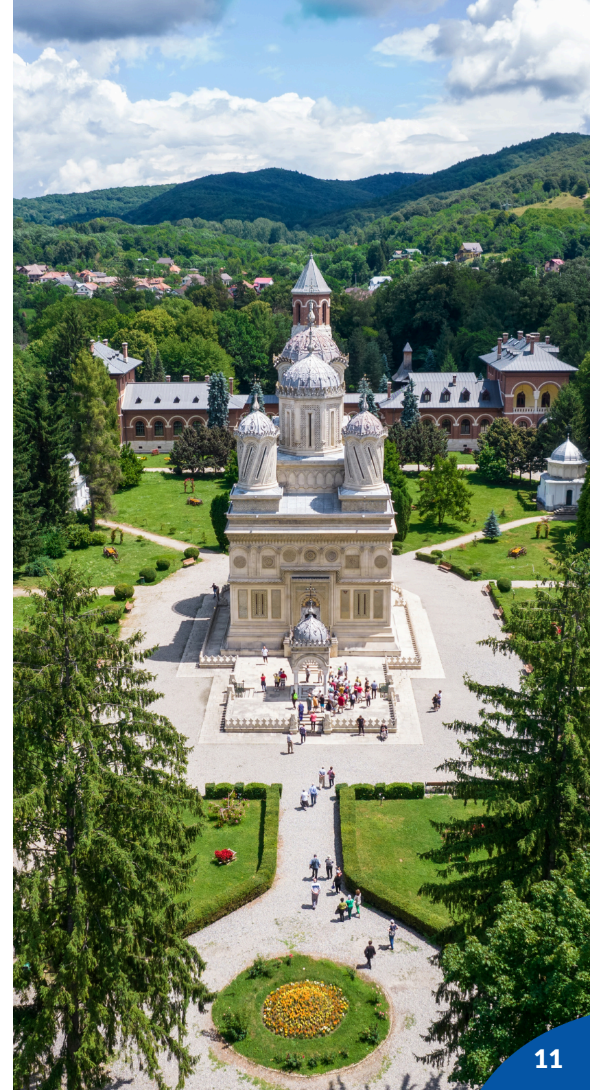
*Curtea de Arges

Pitesti is also strategically located with efficient transportation links to Bucharest, the medieval town of Sibiu, and the Carpathian Mountains , making it an ideal place for people eager to explore both the urban regions and the landscapes that Romania has to offer.