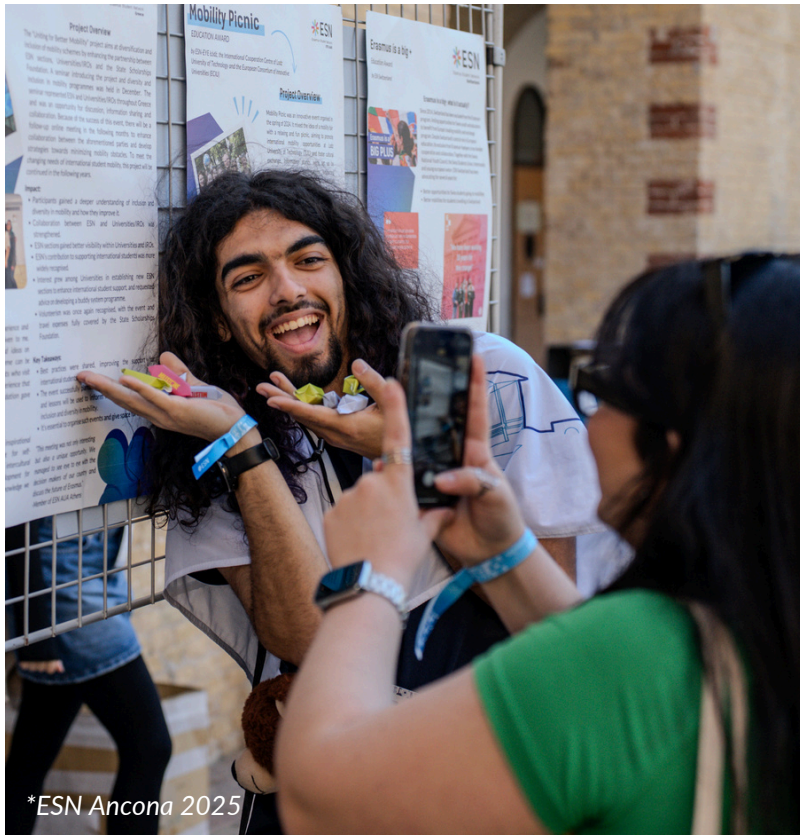
*ESN Ancona 2025

At POLITEHNICA Bucharest , these values are represented locally by ESN Poli, the university’s official ESN section . ESN Poli is run by passionate students who organize activities for incoming international students, ensuring they feel welcome and integrated from the very first day.