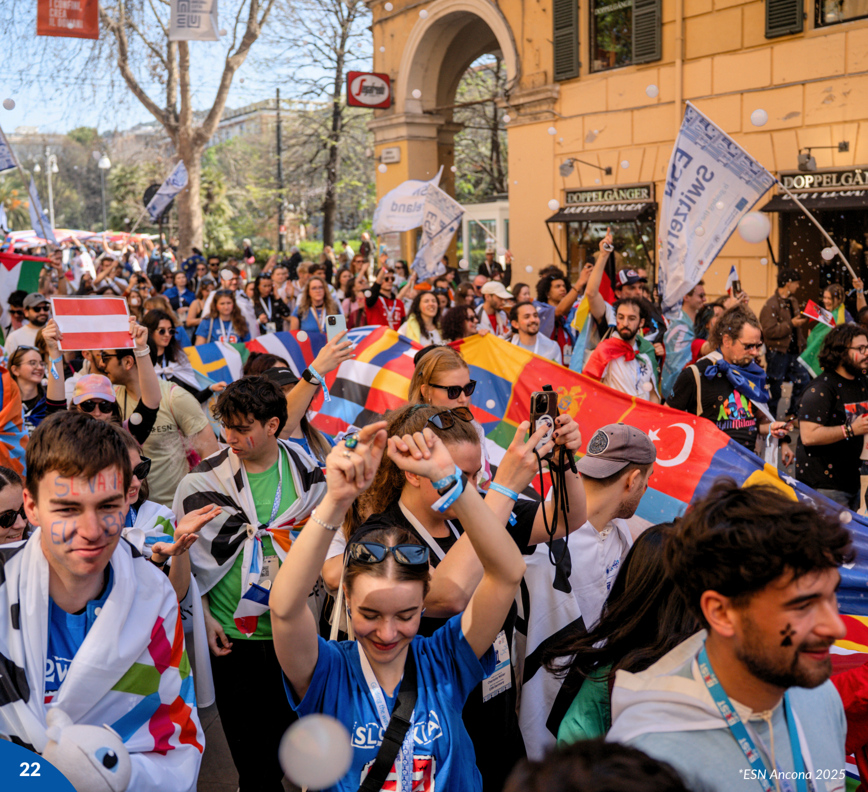
*ESN Ancona 2025