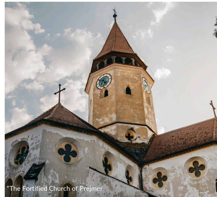
*The Fortified Church of Prejmer