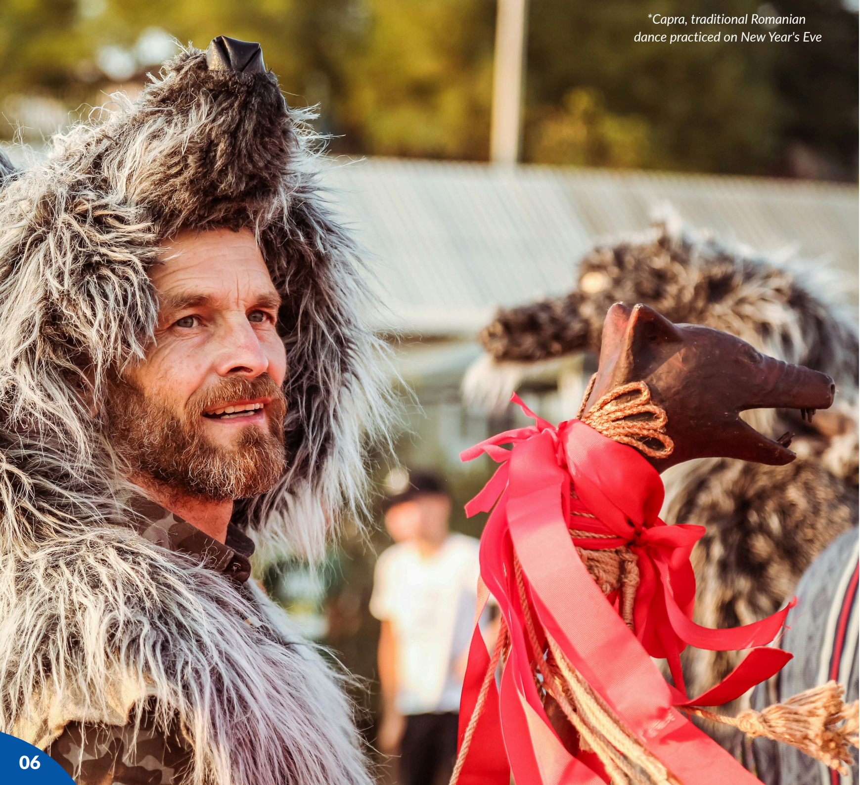
*Capra, traditional Romanian dance practiced on New Year's Eve