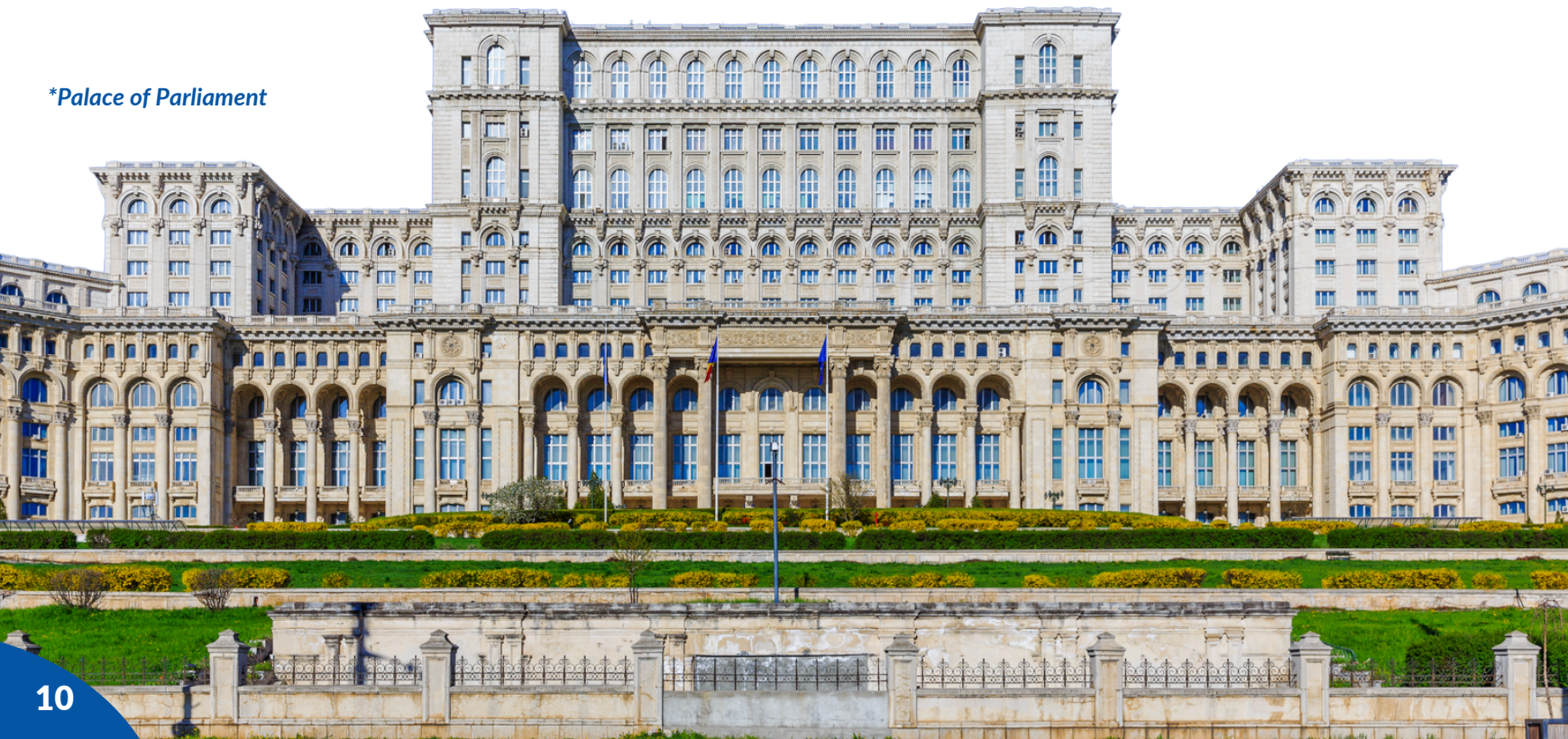
*Palace of Parliament

Though historians trace the actual founding of Bucharest to the 14th century and link it to Voivode Vlad Tepes (Vlad the Impaler), the tale of Bucur remains deeply rooted in the city's cultural memory and is still told as a poetic origin story. A small church known as Biserica lui Bucur (Bucur's Church) , located near the Parliament building, keeps the legend alive.